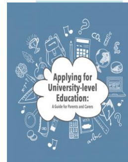
Applying for University- level Education: A Guide for Parents and Carers