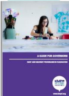
Guide for Governors