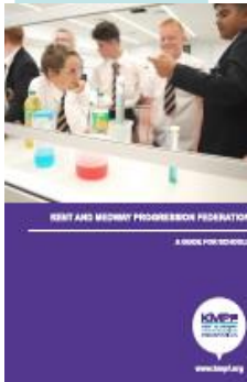
Guide for Schools