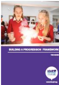
Guide for Building a Progression Framework