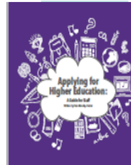
Applying for Higher Education A Guide for Staff