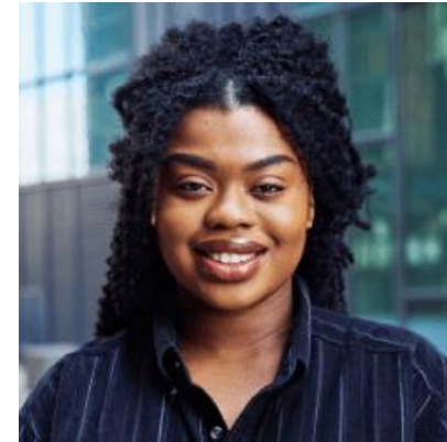
University Access Officer